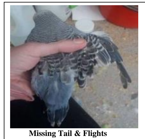
Missing Tail & Flights

Breaking the polyomavirus cycle is frustrating and difficult. Frustrating because it means stopping breeding when you want to be producing chicks, and difficult because it requires a massive effort to clean and disinfect the aviary to prevent re-infection. In order to do this, you must remove all the organic material (dust, feathers, faeces) from the aviary, nesting boxes and breeding cages – this can then be followed by a viricidal disinfectant sprayed on and washed off with a cloth, before being sprayed on and allowed to dry on all surfaces. Allow all the chicks to mature to greater than 6 months old; any chicks that do not grow their flights back should be taken to a veterinarian for euthanasia to prevent ongoing disease transmission.