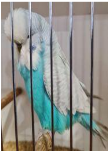
Best Clearwing – Jim Meale