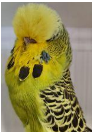
Best in Show Bird – Ian Hunter (Melton)