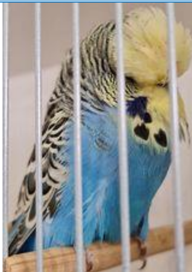
Best Yellowfaced – Alan Rowe