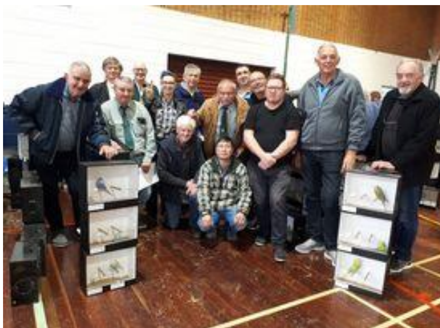
The United team

Very pleased to announce that UNITED won the Championship Show and Shield again. Congratulations to all members that had birds in the team and to those that were successful on the day. Our club won with 866 Points ahead of Melton with 696 and in 3 rd place was Baw Baw with 531.