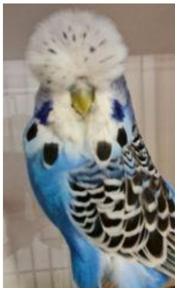
Best Blue – Jeffrey Leong