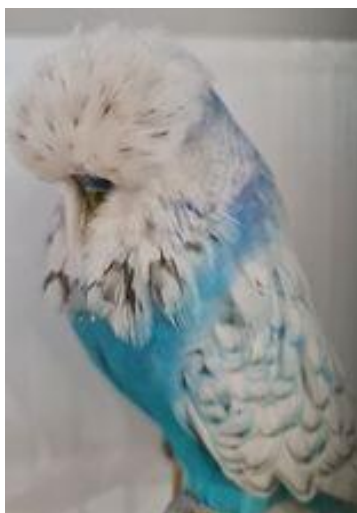
Best Spangle + Reserve Bird in Show – P Thurn (Melton)