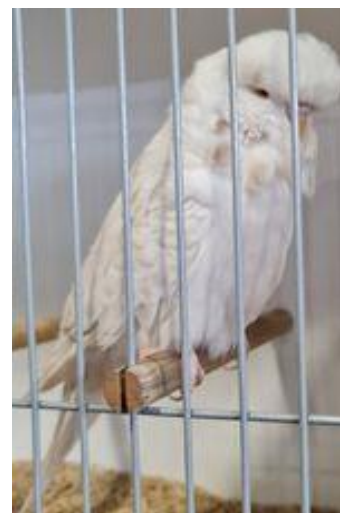
Lacewing + Reserve Intermediate Bird in Show – May & White