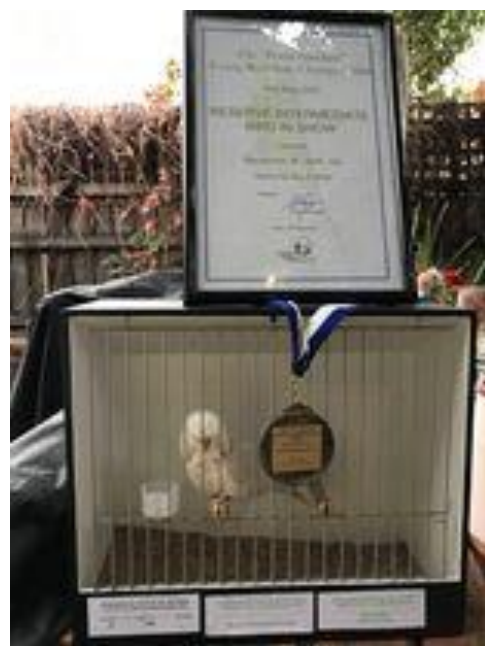
Reserve Intermediate Best in Show won by May & White