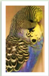
Australian Golden Face bred by Alan Baxter