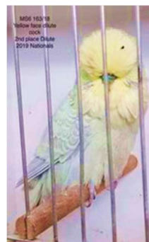
Auction#2 Sold for $1120