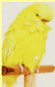
Lutino with washed-out body colour

Question: I've been breeding lutino's with my lacewings, which has helped the size and feathers of my lacewings. But now the problem is that the lutinos produced from these pairings have the yellow that is washed out. My question is, in my new pairing with these washed out lutinos, how do I bring back the buttercup yellow into my lutinos? This is just so that they will be more true to the lutino variety. I've been advised to pair them with a green, but I've heard some conflicting suggestions. For examples, it must go with a normal, not a cinnamon, and dark, not light green. What do you think? Agony Aunt, please help!