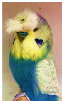
Auction#1 Sold for $590

We're pleased to say that we had a fantastic participation in bidding for the birds. Birds that received the highest bid at the 5 online auctions respectively were: