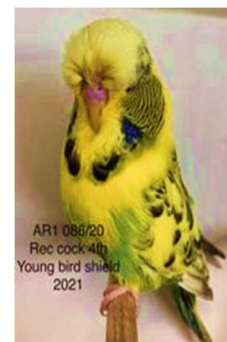
Auction#4 Sold for $1500