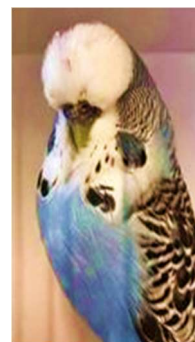
Auction#3 Sold for $680