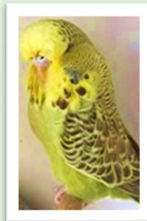
Cinnamon Grey Green bred by Vanessa White

A special Thankyou to all who participated. We still have a number of varieties to cover, so keep your UBC baby photos coming! Let your babies shine!