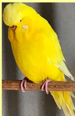
Lutino with Buttercup yellow body colour

Answer: This is Agony Uncle Rowie. Auntie Agony hand balled the lutino question to me to answer. The lutinos in question are most likely carrying the cinnamon factor, therefore diluting the body colour. Dark or olive green normals, opalines, dominant pieds or spangles are the best option to improve the colour, not cinnamon. They could also be used to breed albino's by pairing them to a grey this would produce lutino's split for albino with the grey factor helping to eliminate the undesirable blue sheen in the albino's.