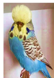
Auction#5 Sold for $800

If you have birds available for future auctions, please message or call Steve on 0417 300 667 to discuss or email him on steve.bradley29@hotmail.com .