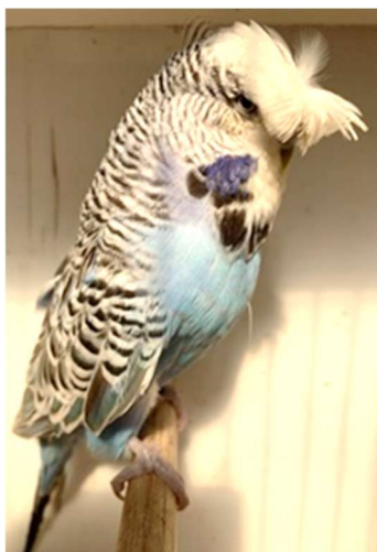
Auction#6 Sold for $820

Once again, we had a great participation. It's all about bidding! Birds that received the highest bid at the two recent auctions respectively were: