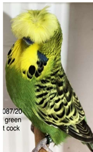
Auction#7 Sold for $510