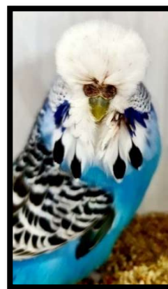
Best BEG Blue A Humadi, United