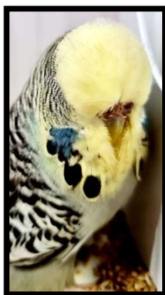
Best BEG Y/Faced A Humadi, United