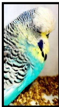
Best BEG Whitecap A Humadi, United