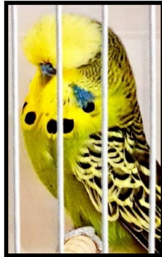
Reserve Intermediate Bird in Show