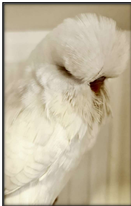
Reserve Bird in Show P Thurn, Melton