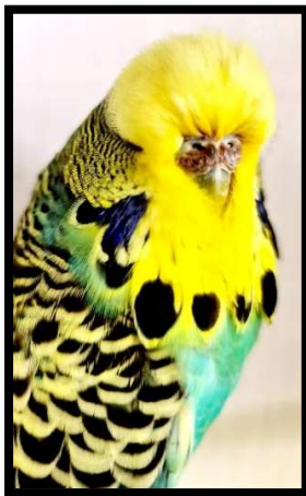
Best Australian Golden faced A Baxter, United