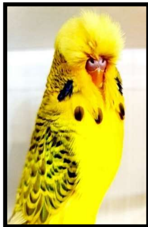
Best Fallow A Rowe, United