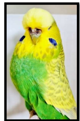
Best BEG Clearwing S Wong, United