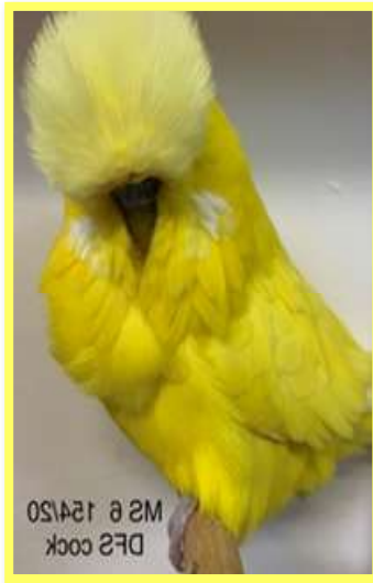
Auction#10: Sold for $1220