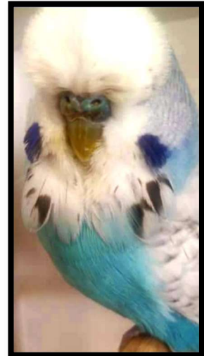
Reserve Beginner Bird in Show