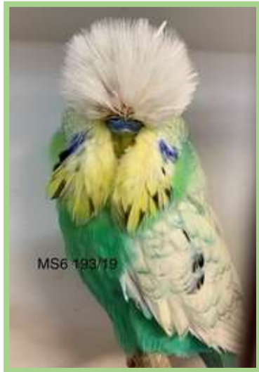
Auction#9: Sold for $1210

Birds that received the highest bid at the auctions respectively were: