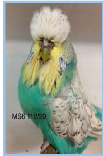
Auction#11: Sold for $1300

The next auction will be in early April.