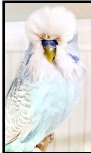
Best Beginner Bird in Show