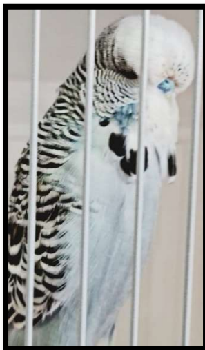
Best Intermediate Bird in Show