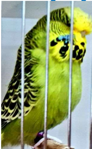
Intermediate: Neil Hunt