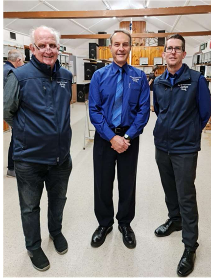
Our three fabulous judges who did a fantastic job in judging the birds on the day.