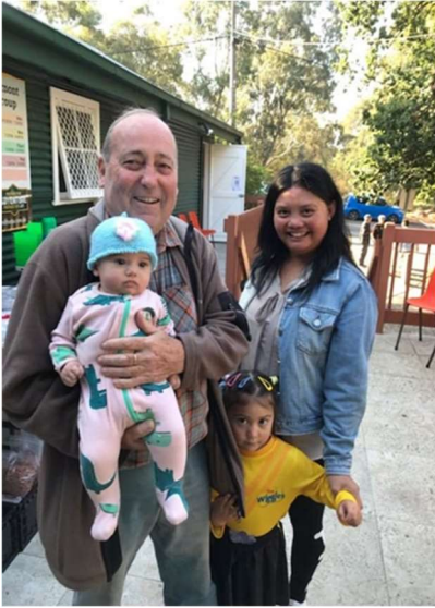
Well, exhibitors came in all ages.