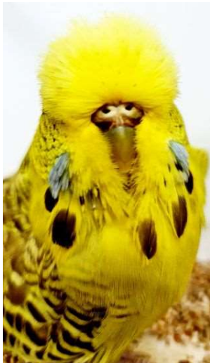
Champion: Alan Rowe