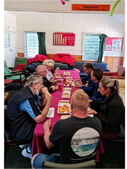
Pulled pork rolls being served.