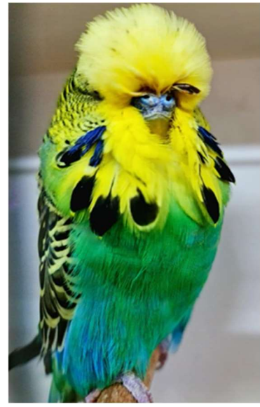
Beginner: Carnick (Carmel & Nick)