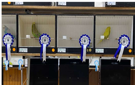
Some rosettes awarded to best colour series birds