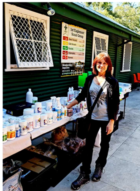
A special Thankyou to Aussie Pet Connections That had a great stand with all the requirements members and visitors could need. 😊